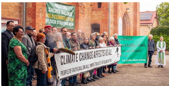
People of faith call for climate justice