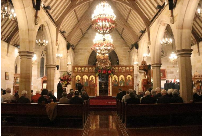
Greek Orthodox Cathedral, Sydney