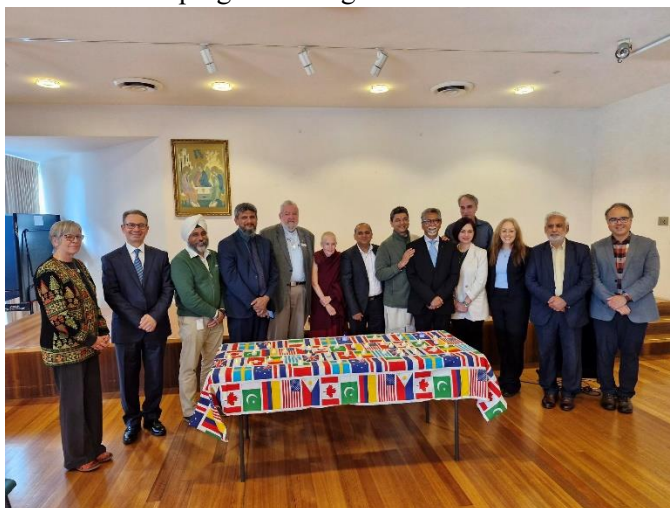
Interfaith Gathering, Parramatta