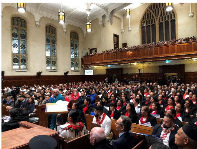
St Stephen's Uniting Church, Sydney