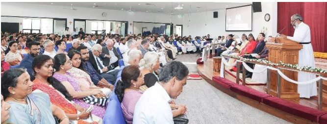
Bethel Mar Thoma Church, Horsley Park, NSW